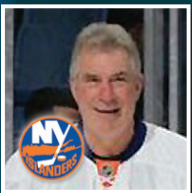
"New York Islanders Legend Clark Gillies"